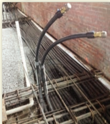
The flexibility and long lengths of TracPipe PS-II allowed for a total install time of just 36 hours versus an estimated 1200 hours for black iron pipe.